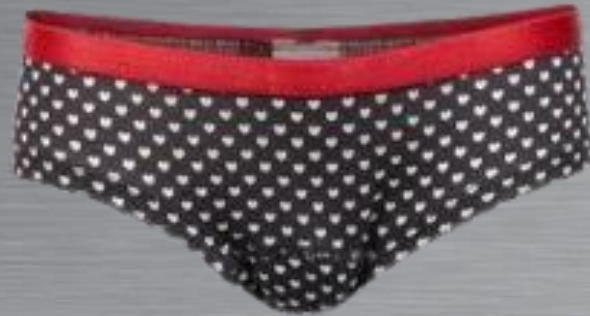
Girls - Hipster