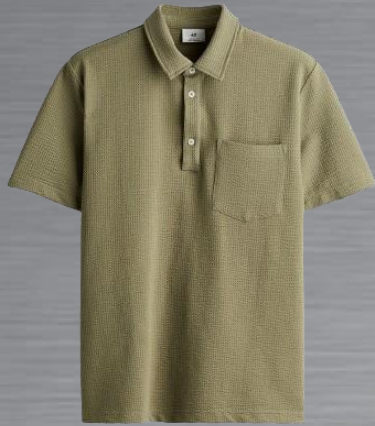
Tee with Pocket