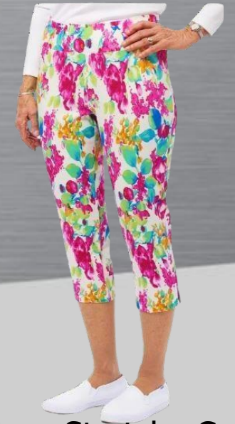
Pattern Stretchy Capri