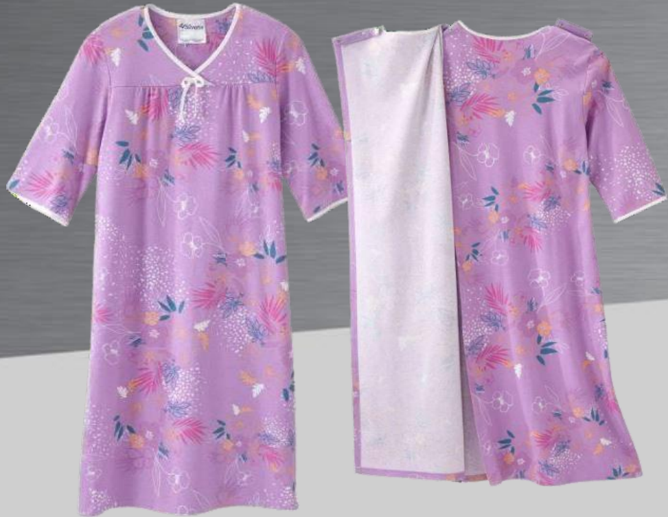
Women's No Peek Hospital & Home Care Gown – Assisted Dressing