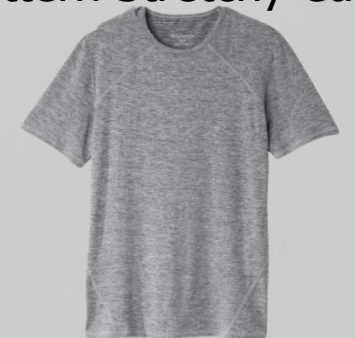
Men's Open Back Active T-Shirt