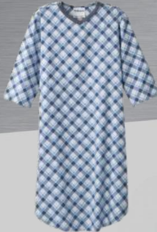
Men's Flannel Hospital & Home Care Gown