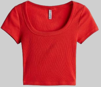
Rib Short Tee