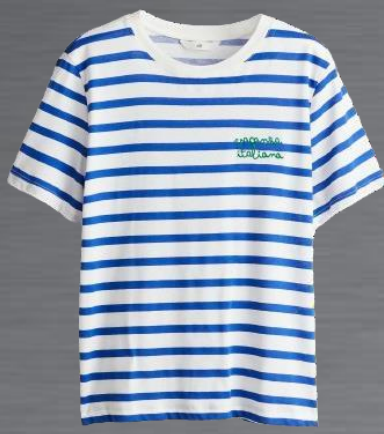
Round Neck tee