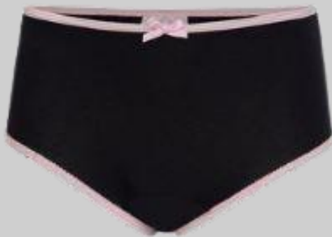
Girls - Brief

Age Group From 2-3 Years to 10 -12 Years