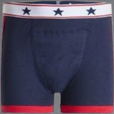
Boys Training Pant