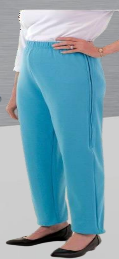
Side Zip Pant