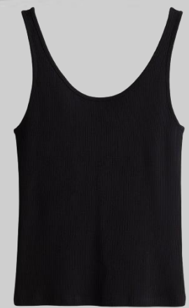
Ribbed Vest Top