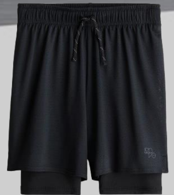
Double Layered Sport Shorts